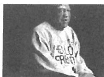
Another Bill Cosby Accuser Sues Him for Defamation