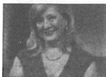
Lorena Bobbitt Opens Up About Cutting Off Her Husband's Penis on St...