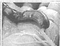
If You Have Gas, Bloating, Constipation or an Upset Stomach Please Watch This