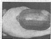
1 Food That Kills Diabetes