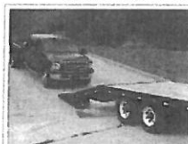
It doesn't get much worse than this! Watch what happens when this guy tries to load his new truck.