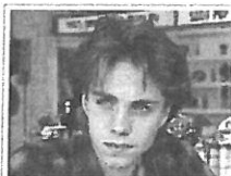
Celebs you didn't know passed away: #17 is Shocking