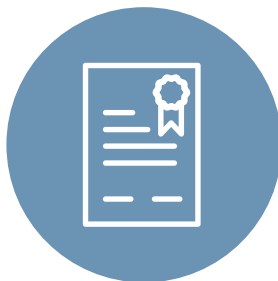
STOCKS AND BONDS