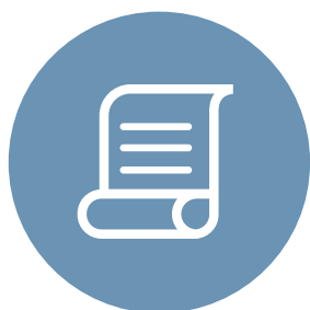
LIFE INSURANCE POLICIES