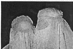
The terrorist wears a burqa Prof. Phyllis Chesler