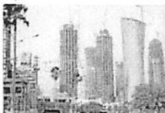
Western relativists sell Western culture to Qatar Giulio Meotti